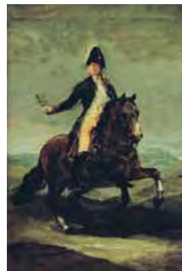
Attributed to Francisco José de Goya and Lucientes, Equestrian portrait of Ferdinand VII (sketch), circa 1808, oil on canvas, 42 x 28 cm