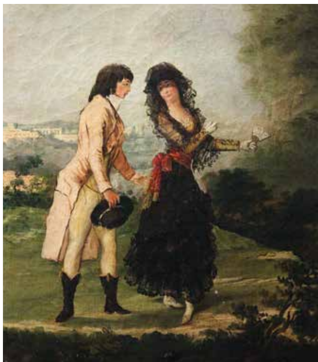
Attributed to Francisco de Goya y Lucientes, The elegant Couple (copy of the painting Le Colloque galant, 1793-1797), oil on canvas, 55 x 39.6 cm

This project could, in the long term, better define the artistic approach of Goya and the implication of the collaborators in his workshop. The aim of the exhibition is to provide both the large public and the painting connoisseurs with a unique opportunity to enjoy and admire many masterpieces that will also be analyzed in detail (documentation and technical analysis).