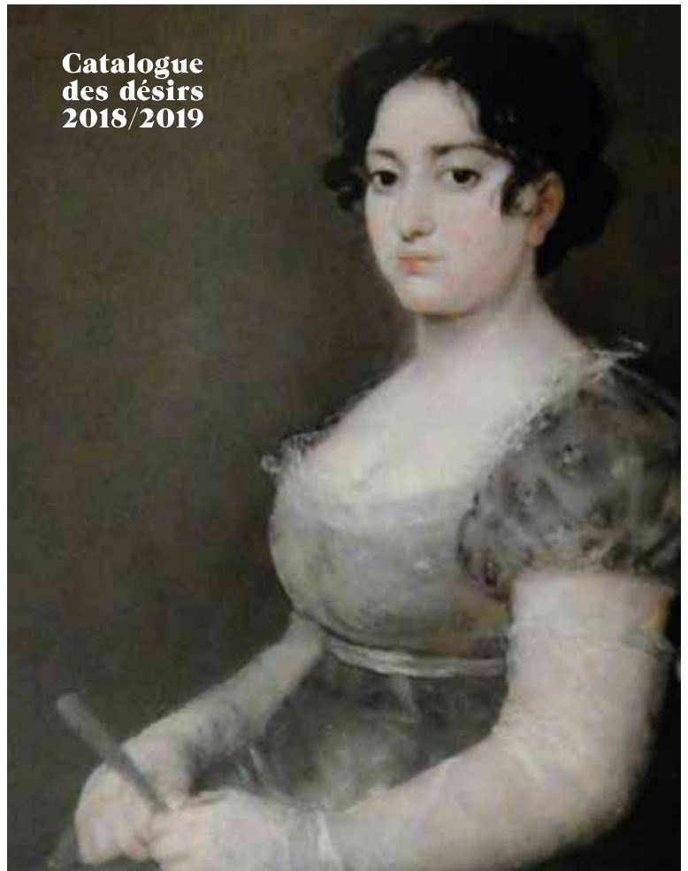
Francisco de Goya and Lucientes The Woman with a fan, circa 1805-1810