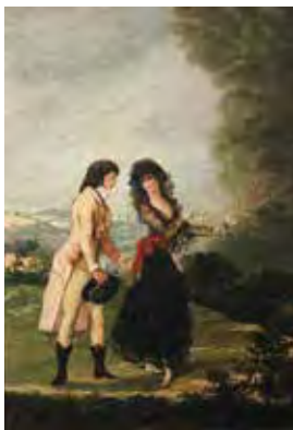
Attributed to Francisco de Goya y Lucientes, The elegant Couple (copy of the painting Le Colloque galant, 1793-1797), oil on canvas, 55 x 39.6 cm