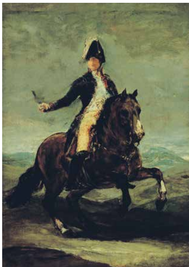
Attributed to Francisco José de Goya and Lucientes, Equestrian Portrait of Ferdinand VII (sketch), circa 1808, oil on canvas, 42 x 28 cm