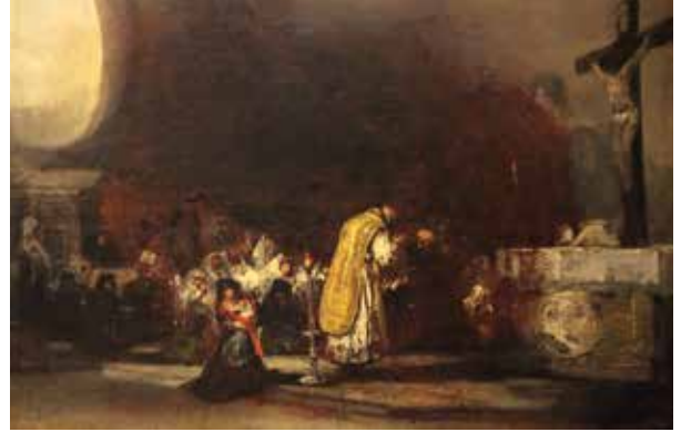
Attributed to Francisco José de Goya and Lucientes, The Churching , around 1819, oil on canvas, 53.7 x 77 cm