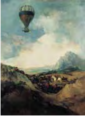
Attributed to Francisco José de Goya and Lucientes, The Balloon , after 1824 (?), oil on canvas, 105 x 84.5 cm