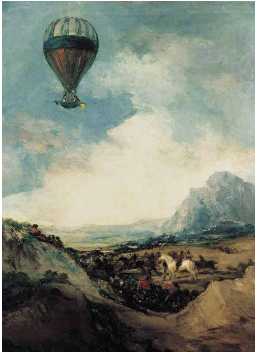
Attributed to Francisco José de Goya and Lucientes, The Balloon , after 1824 (?), oil on canvas, 105 x 84.5 cm

Nearly 90 works loaned by museums and private collections around the world (France, Germany, Hungary, Spain, Switzerland, UK, USA) will be on display in the Jacobins' Church (Église des Jacobins), an Agen architectural jewel and an emblematic place for the Museum's temporary exhibitions.