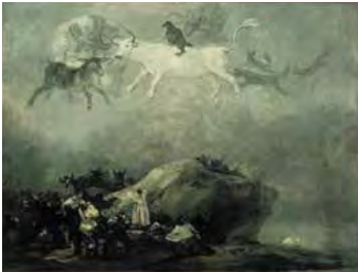
Attributed to Francisco José de Goya and Lucientes, Capricho , after 1824 (?), oil on canvas, 37.8 x 50 cm