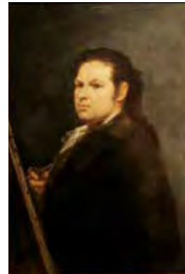
Attributed to Francisco José de Goya and Lucientes, Self-portrait , 1783, oil on canvas, 83 x 56.5 cm